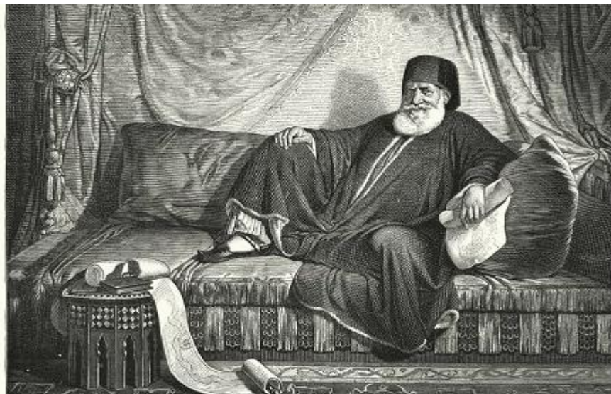
Napoleonic Figures Mohammed Ali Pasha

remained my beloved, and my passion for you has always kept its purity. I can recount how you remained an Arab girl in your bedouin Fustat - until you became indeed the conqueror of hearts..... In this Fatimid Glory you put on your best garments and peoples hearts came seeking you from all corners of the world...the minaret of Al-Azar could be seen proclaiming the Word of God, the multitudes came seeking your knowledge and bounty — Times however changed... and after your wealth and glory, you saw misery and weakness... My heart was bleeding for you, and how could I remain still, seeing you suffer under the tutelage of the Mamluk eyeing you as a tiger eyes his prey? Yet in your difficulty you were noble, this tyrant was eclipsed and you came out victorious. — And how could you not, when God has sent you this Genius from Kavala?... I could see him sitting there fixing his gaze on you, he could not but jump to your rescue: “Here I come - Here I come!” .... I saw him descending on you, his arms wide open, and you threw yourself into his embrace...He disappeared in you and you in him and together you became one indivisible person. Can anyone mention Cairo without the phantom of Mehmed Ali leaping to mind? Doesn't he still, to this day, hover high above his Citadel, defending and protecting you?