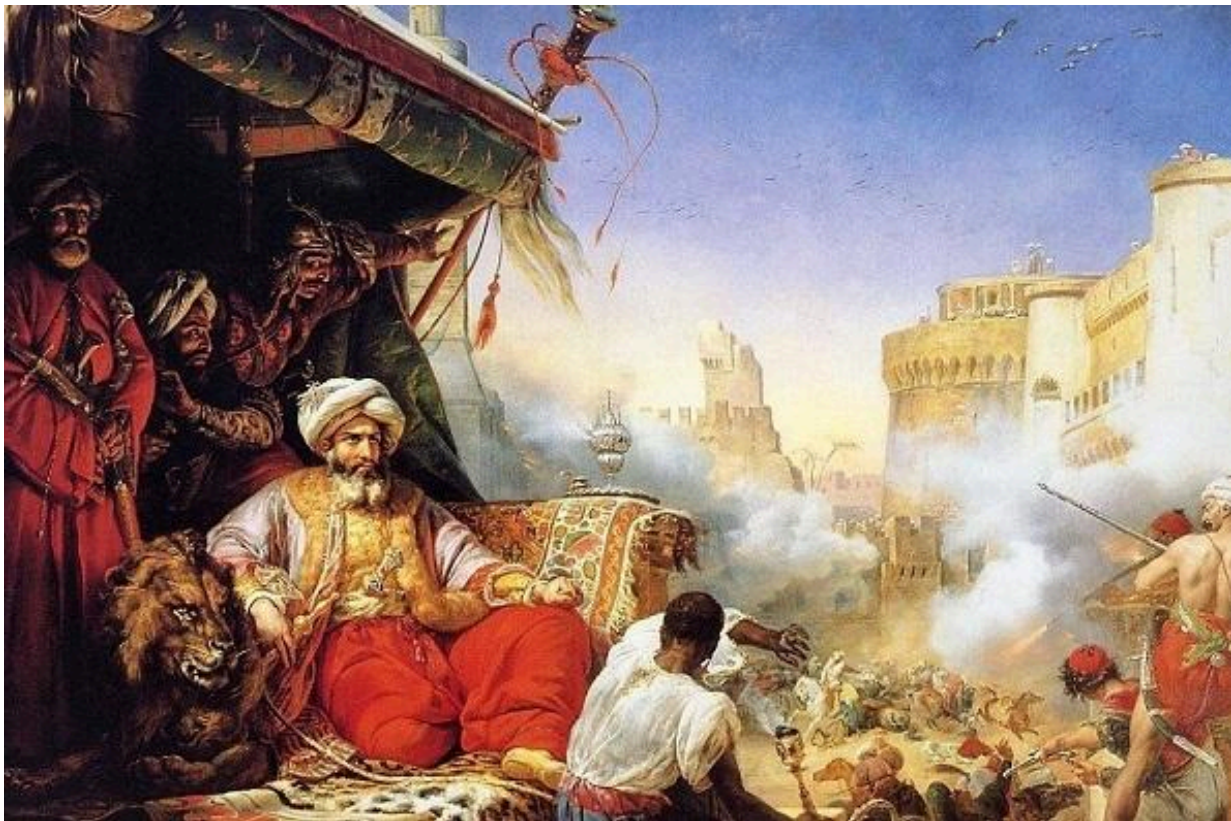
March 1, 1811 'Massacre of the Mamelukes'

In 1811 the famous Massacre of the Mamelukes introduced Egypt's new Pasha to the World. In Count de Forbin's 1817 book ' Travels to Egypt and the Holy Lands ', he sketched a version of ' The Massacre '. Then the famed artist Horace Vernet, did a full blown painting that traveled Europe, along with a black and white souvenir postcard that was widely published. — Artists were the TV photojournalists of the day, and naturally everyone was curious to know more about Egypt's Pasha .