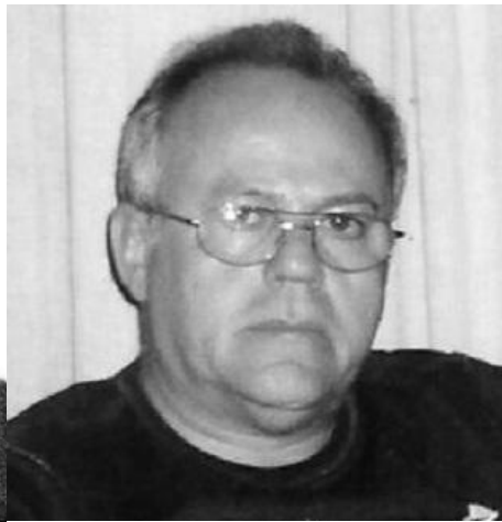
The Mexican Healer

.... Two weeks later a package arrived from The Mexican Healer . I unwrapped a pyramid shaped crystal, took out bags of Asian sweets, and at the very bottom of the box, engraved with crossed daggers over a palm tree was — a brass tray!