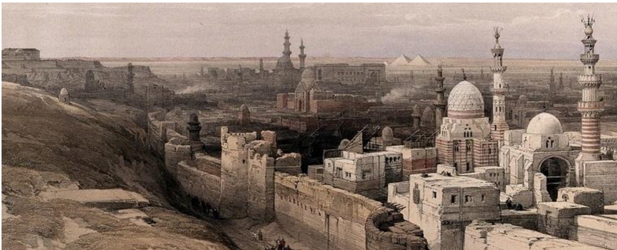
Cairo Citadel looking West to Pyramids by David Roberts