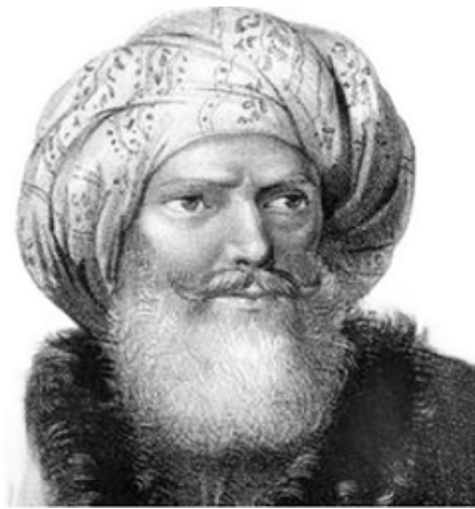
Mohammed Ali Pasha

Eduardo brought me back. For some time we were both engulfed in silence, totally void of oxygen. Butheita was like the Quetzal bird that dies if it's caged. Then Eduardo, taking a breath, broke our silence, " I can't begin to imagine Ali's pain when he returns. " Now I understand the Message of the Sphinx : " Heal his heart, ease his pain. "... But how?