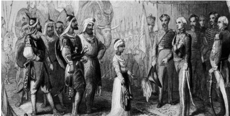
Submission of Maharaja Duleep after 1st Anglo-Sikh War 1846