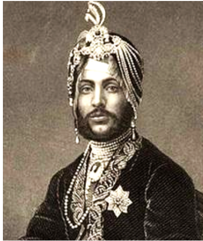
Maharaja Duleep Singh

'It is to me Ma'am, the greatest pleasure thus, to have the opportunity, as a loyal subject, of myself tendering to my Sovereign the Koh-i-Noor.'