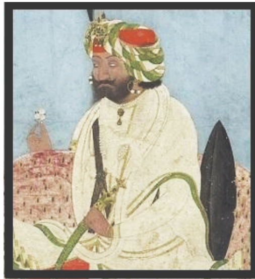
Gulab Singh Dogra

Months later, October 1839, the new emperor Kharak Singh was overthrown in a coup by his Prime Minister, Wazir Dhian Singh Dogra . Somehow the minister's brother, The Jammu-Fox, Gulab Singh Dogra , came into possession of the Koh-i-Noor . Kharak was slowly poisoned, and died in November 1840, followed by the death of his son Nau Nihal , while leaving the funeral. Chand Kaur , wife of Kharak and mother of Nau Nihal , fought for the throne against Raja Shere Singh , another purported heir. A peace was brokered by Dhian , but soon after, Chand's head was bashed in by her maid-servants, who were all banished with their tongues cut out!