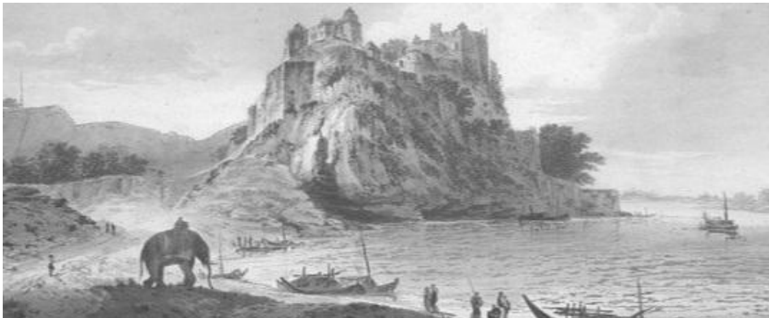
Chunar Fort on the Ganges

Scattering coins on the floor of her cell with notes to be found: 'You put me in a cage and locked me up, for all your locks and sentries I got out by my own magic... I told you not to push me too hard — but don't think that I ran away, understand well, that I escaped myself unaided....When I quitted the Fort of Chunar, I threw down two papers on my gaddi (seat) and one I threw on the European charpoy (bed). Now don't imagine I got out like a thief.' https://archive.org/details/ThreeLettersOfMaharaniJindKaurDr.GandaSingh