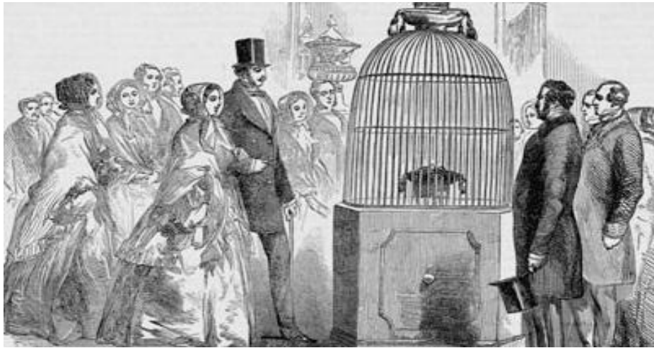
The Great Exhibition 1851

ing the Empire's might, where the Koh-i-Noor took pride of place. The public response was underwhelming , no matter how the display was changed. So in 1852, Garrads the royal jewelers, under the supervision of Prince Albert and the Duke of Wellington , cut the 191 carat stone to enhance its brilliance, down to 105 carats!