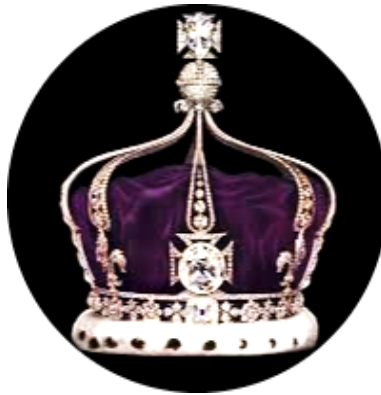
Koh-i-Noor Diamond British Royal Crown