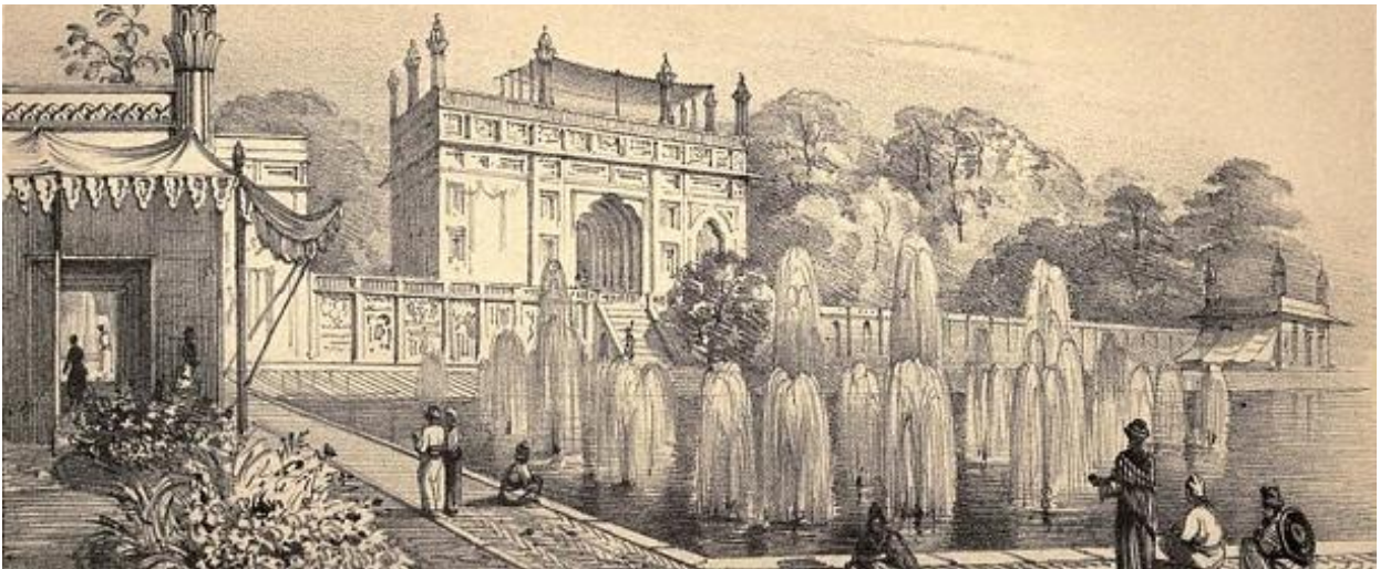
Shalimar Gardens, Lahore

From Samman, Jindan is sent to Sheikhpura Fort without her son : 'You have snatched my son from me. You could have kept me in prison, dismissed my men, turned out my maid servants, but you should not have separated my son from me. In the name of the God you worship, the King whose salt you eat, restore my son to me. I cannot bear the pain of this separation. Instead of this you should put me to death. He has no brother or sister, his father he has lost, to whose care has he been entrusted?'