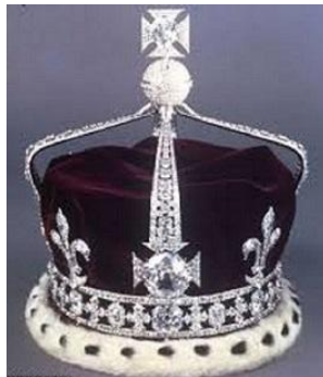
The Koh I Noor Diamond

As dusk enveloped Delhi, the fragrance of night-queen filled the air, while we strolled around Qutub Minar , the 900 year old iron tower that doesn't rust. The light emanating from the young Swami's head attracted a swarm of flying critters, and looked like a jeweled turbaned crown . That night I had the wildest dreams, floating above the pines in Goa, with his Master, Bhagwan Shree Rajneesh , a man I'd never seen or heard of. This was years before Rajneesh became famous in the 80s for his hundred Rolls Royces and his Commune in Oregon, long before the Netflix 2018 documentary "Wild-Wild Country" . — Then 25 years later, there I was sitting alone on a cushion under the dome in his New Delhi Ashram, transfixed, looking at Osho's six foot photo, my first time there. Suddenly the sky became gray and crackled with electricity. That's when the Universe whispered in my head, " We are with you every step of the way ". And then, the skies cleared...That was 2003, my last trip to India.