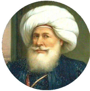
Mohammed Ali Pasha Viceroy of Egypt