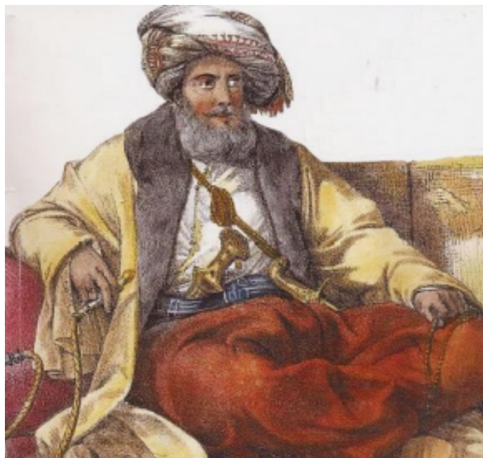
Mohammed Ali Pasha of Egypt

...and on page 26 of this book, right before my eyes was a sketch of Mohammad Ali Pasha... My Ali !