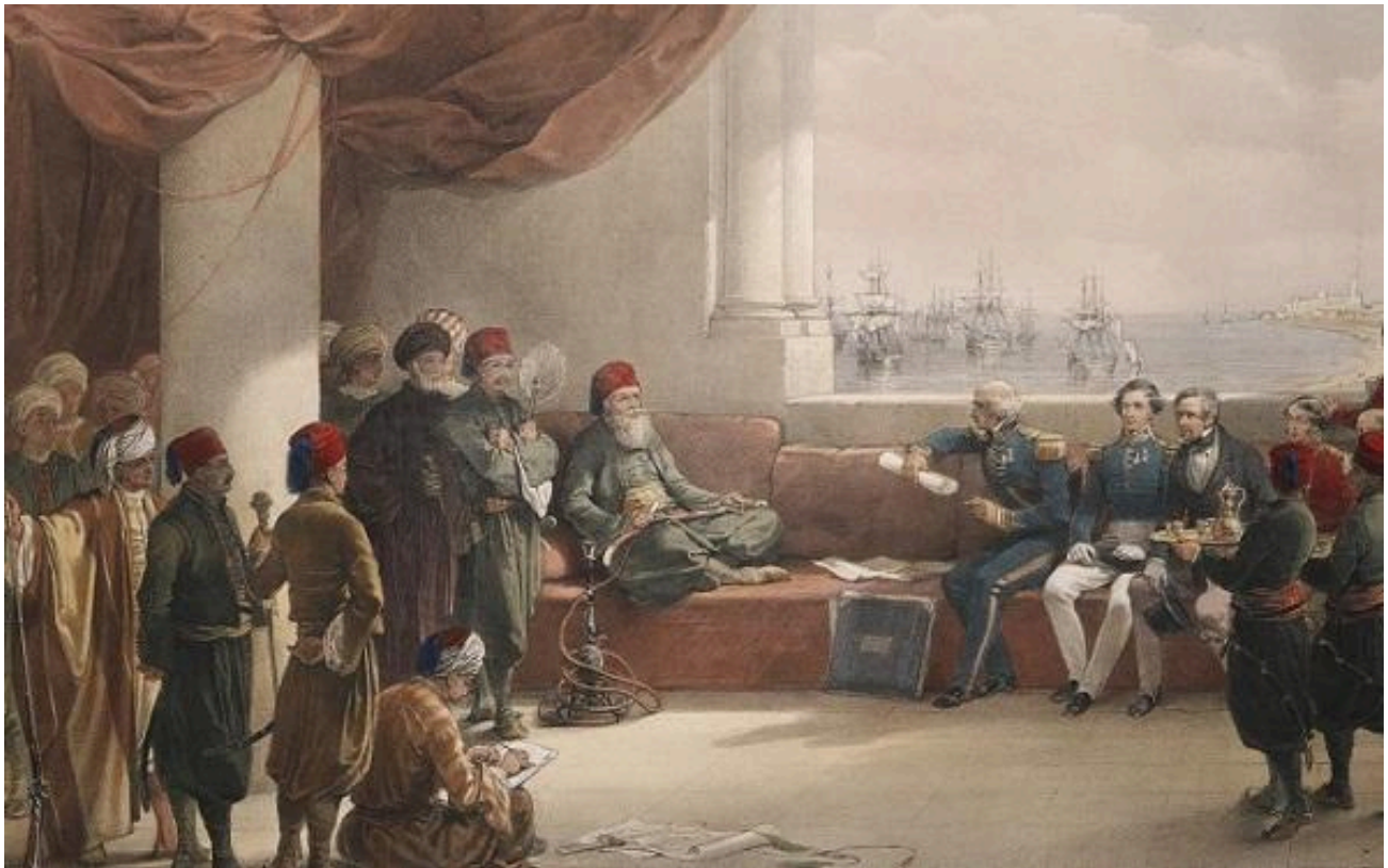
'Interview with The Viceroy of Egypt at his Palace' 1839 David Roberts